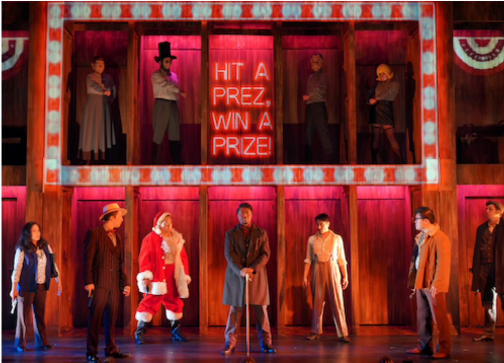
Stephen Sondheim's "Assassins."