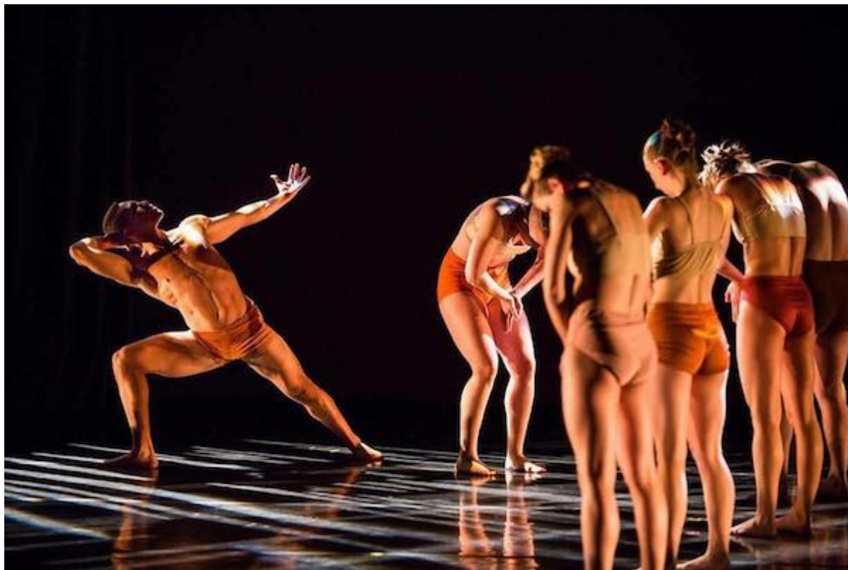
Acts of Matter.

Dancing with the Stars Live Tour 2022 at Thousand Oaks Civic Arts Plaza, 2100 E. Thousand Oaks Blvd., Thousand Oaks, Sun., March 13, 8pm, $59.95-$374-$59.95. Also at San Diego Balboa Theater, 868 Fourth Ave., San Diego; Tues., March 15, 7:30pm, $44-$123. Also at Fox Performing Arts Center, 3801 Mission Inn Ave., Riverside; Wed., March 16, 7pm, $49-$99; Segerstrom Center for the Arts, 600 Town Center Dr., Costa Mesa; Wed.-Fri., March 16-18, 7:30pm, Sat., March 19, 2 & 7:30pm, $39.