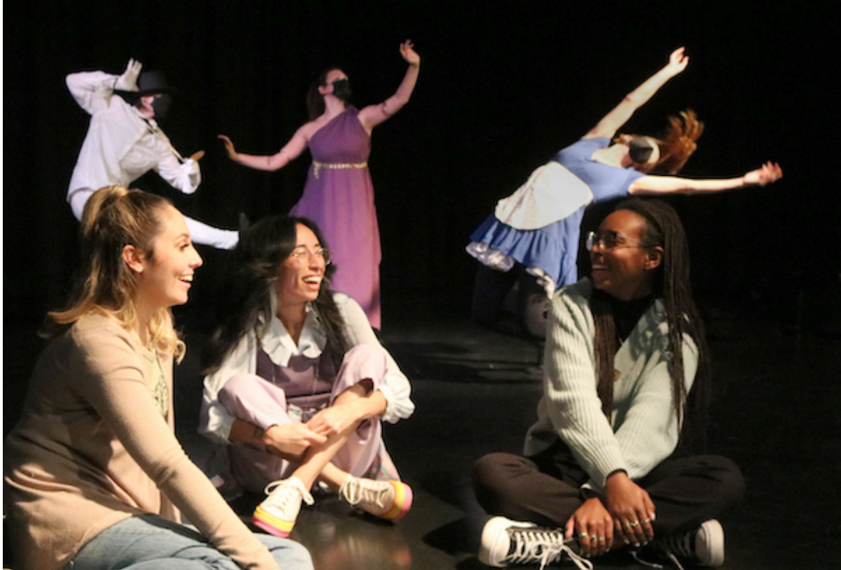
Lineage Dance's "Curiosity Tales."

Dance is often among the ten performances, each ten minutes that make up the monthly series Max 10 at the Electric Lodge, 1416 Electric Ave., Venice; Mon., March. 7, 7:30pm, $10. Info & tickets at Electric Lodge .