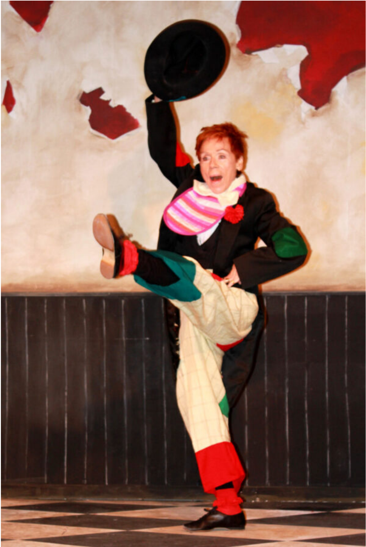
Maybin Hughes.