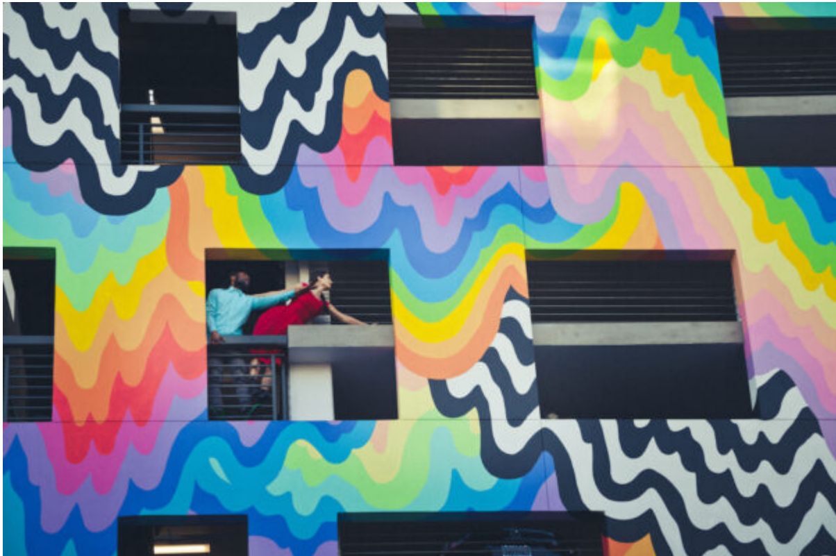
Heidi Duckler Dance.