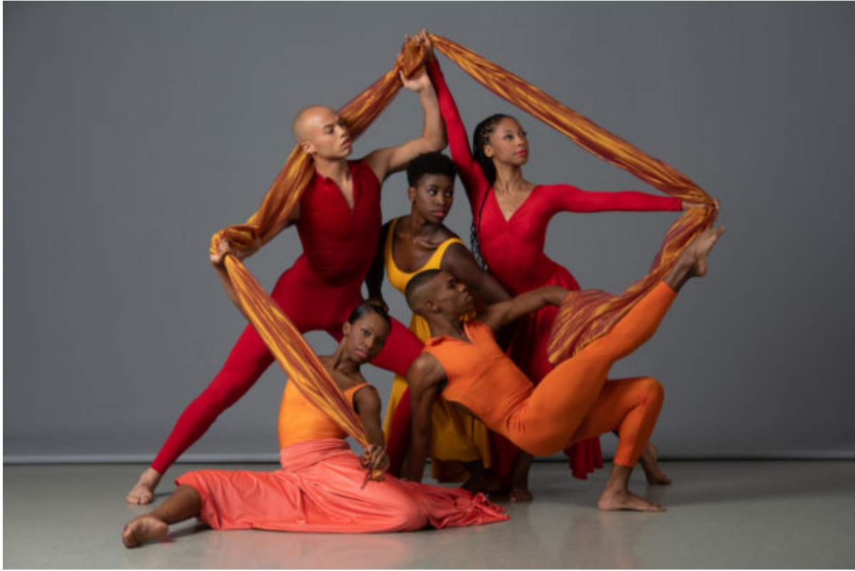
Ailey II.

Ailey American Dance Theatre. Their youth, strong training, and stamina are showcased to the max by the energized demands of the repertoire. Smothers Theatre, Pepperdine University, 24255 Pacific Coast Hwy., Malibu; Thurs., March 3, 8pm, $22.50-$50. Details & tickets at Pepperdine University .