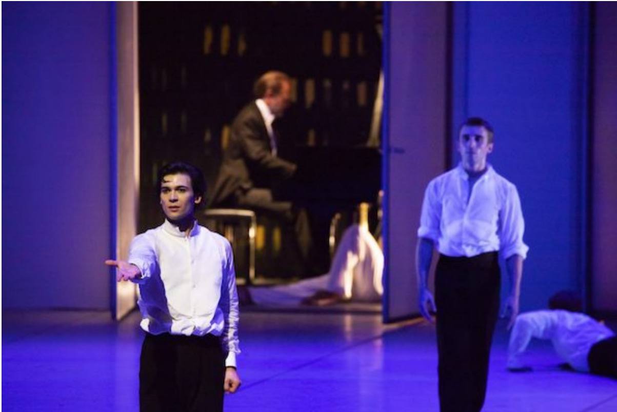
Hamburg Ballet's "Bernstein Dances."

Hamburg Ballet with LA Opera in St. Matthew Passion at Music Center Dorothy Chandler Pavilion, 135 N. Grand Ave., downtown; Sat., March 12, 7:30pm, Thurs, March 17, 7:30pm, Sun., March 20 & 27, 2pm, Sat., March 26, 7:30pm, $23-$292. LA Opera .