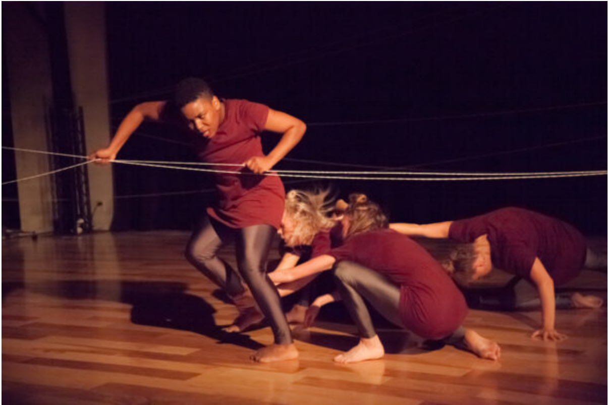
MashUP Contemporary Dance Company.

Blvd., downtown Arts District; panel at Sat., March 5, 2 & 7pm, $30. Eventbrite .