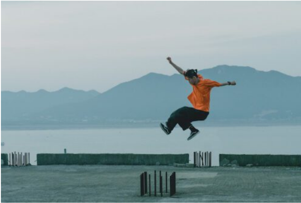
Dance Camera West.

This entry was posted on Thursday, March 3rd, 2022 at 9:17 pm and is filed under Theatre , Music , Dance , Visual Art