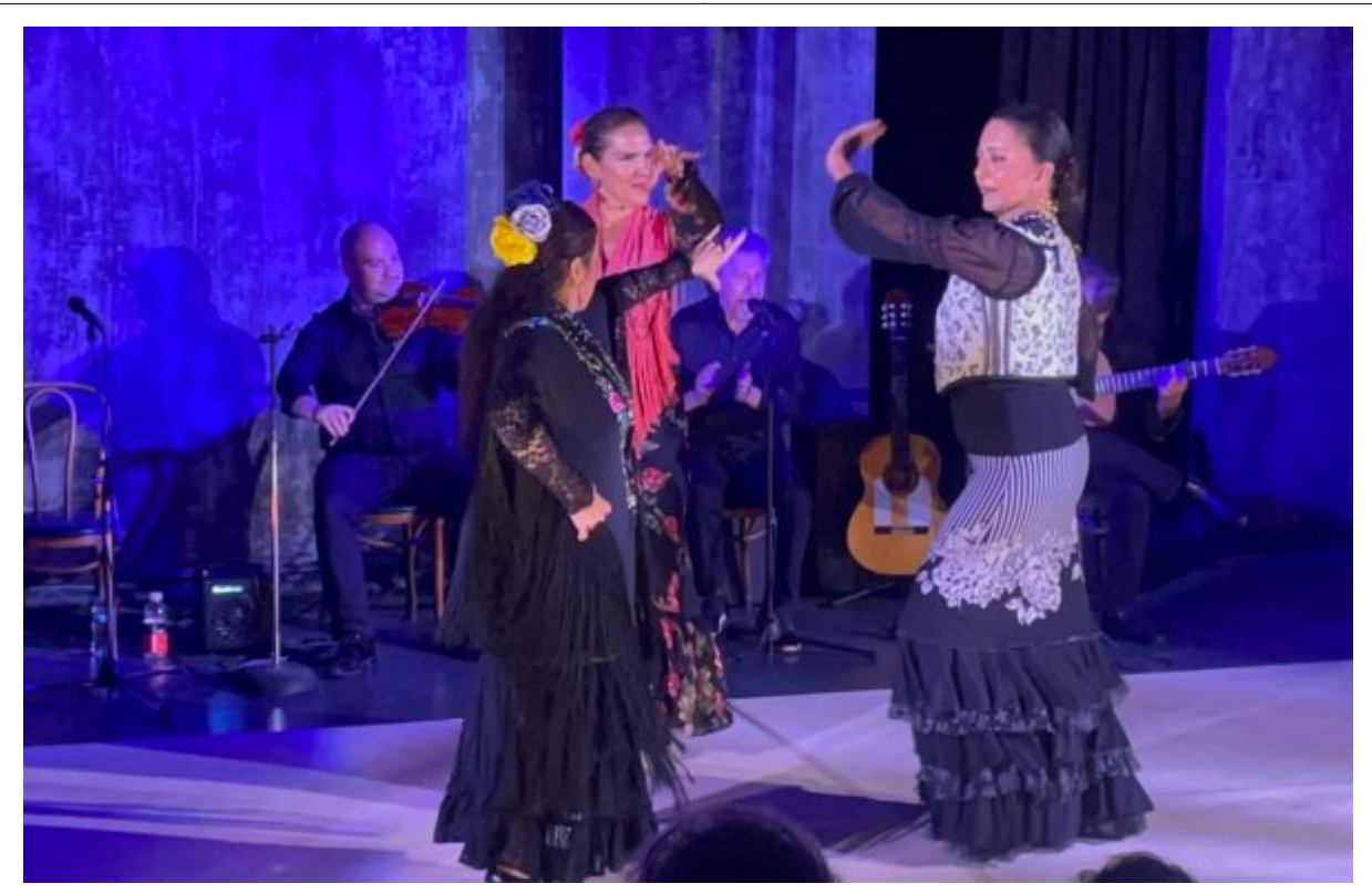
Forever Flamenco.