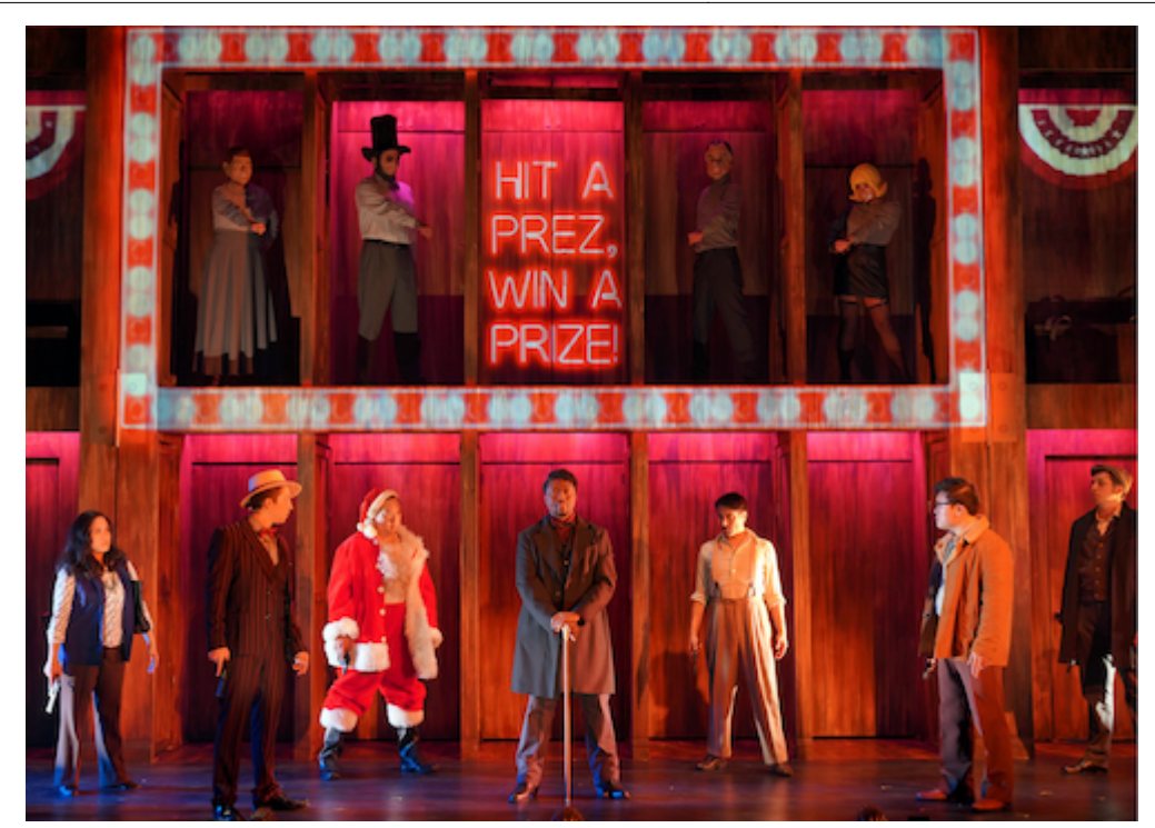
Stephen Sondheim's "Assassins."