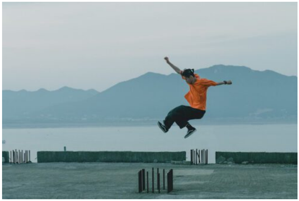
Dance Camera West.