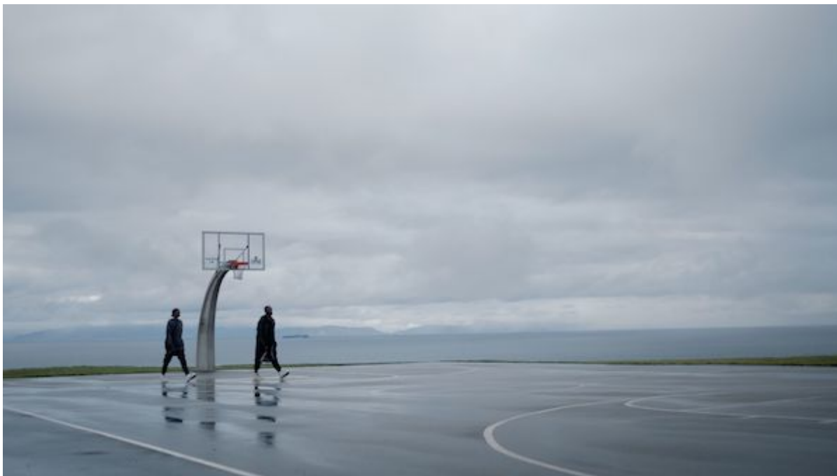
“Films.Dance Round 2.”