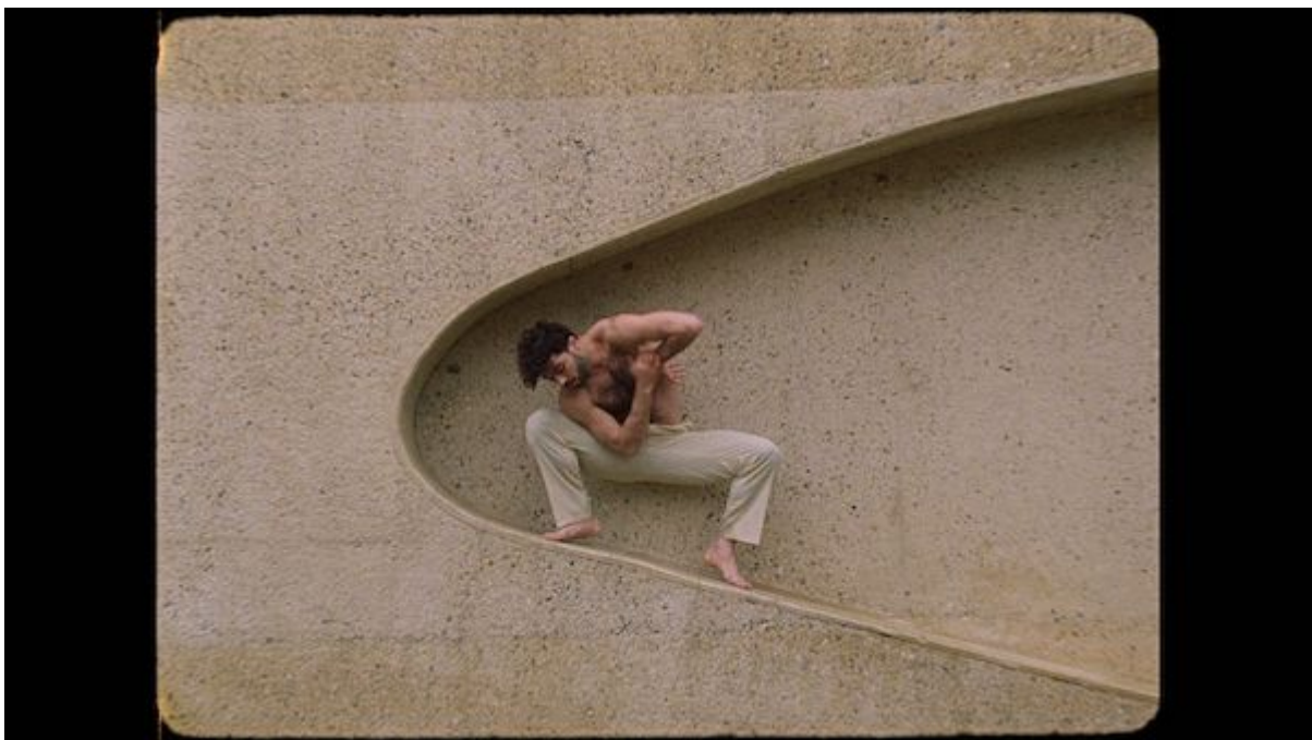
“Films.Dance Round 2.”

With backing from several important U.S. theaters, Films.Dance proved a highly successful and innovative effort to gather dancers, choreographers, and film directors from the U.S. and around the world to create 15 original short dance films. In January 2021 the films started to roll out, one each Monday over four months, available for free. After its debut, each film joined an online roster that continues to be viewable for free.