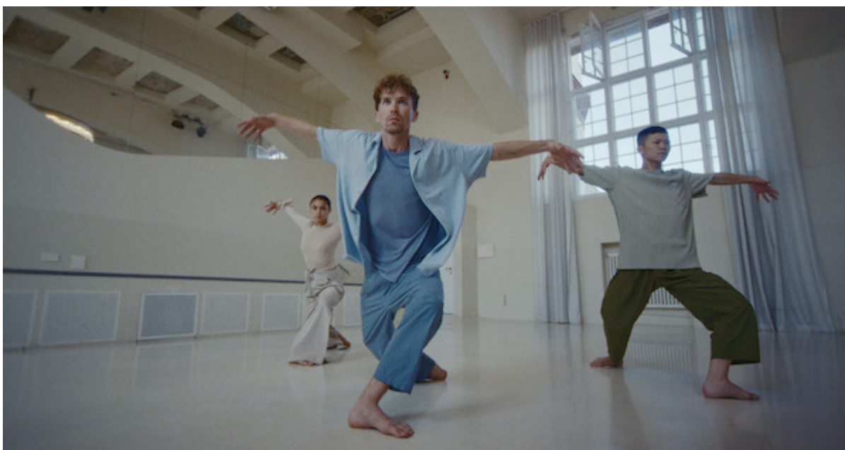
“Films.Dance Round 2.”

The new series was financed by returning sponsors L.A.’s The Soroya, Chicago’s Harris Theater, and the Brooklyn Academy of Music (BAM), plus new sponsor Stanford University’s Stanford Live.