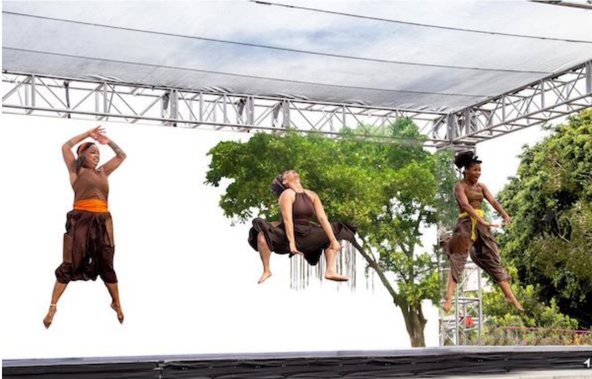
Viver Brasil.

Continuing its roll out of encore videos from past performance, Viver Brasil adds Peace Transcends to the examples of the rich repertoire reflecting efforts to preserve Brasil's African culture in dance and music. Free at Viver Brasil . The ensemble also is part of KCET's Southland Sessions streaming at KCET .