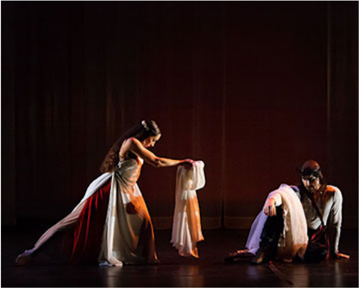
The Scarlet Stone.

with the film's creators. Fri.-Sun., Oct. thru 31, online at TIRGAN .