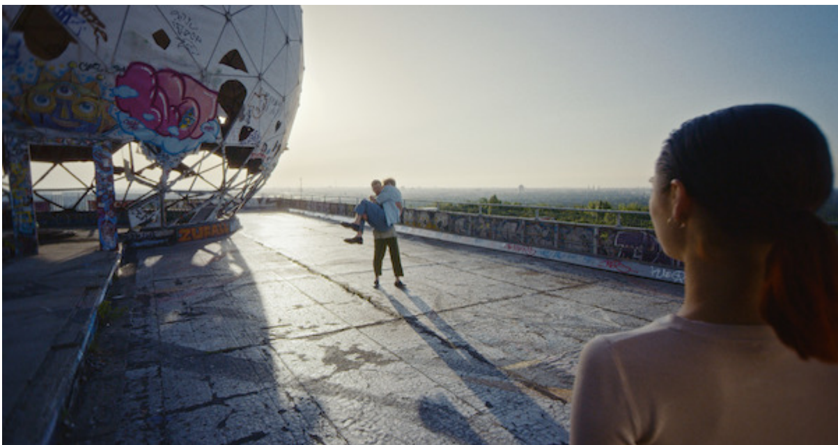
“Films.Dance Round 2.”