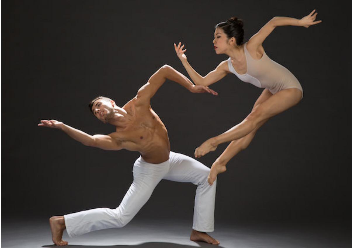
Ballet X.