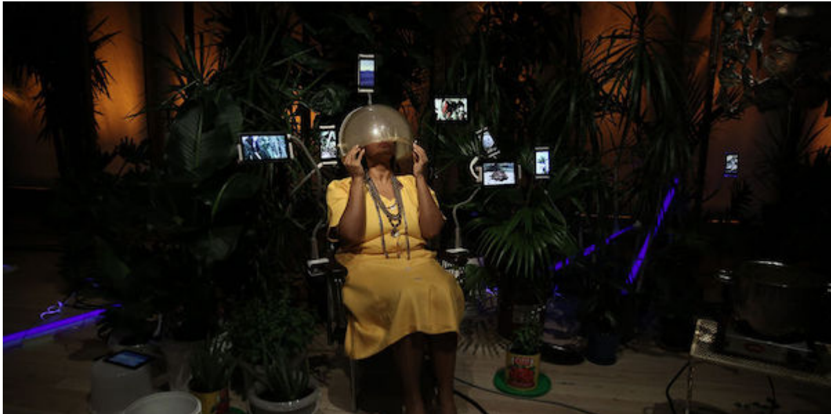
Hammer Museum's "No Humans Involved."

(ICA LA), Witch Hunt surveys 16 artists focused on feminist, queer, and decolonial approaches to consider current and historical events. Among the artists who are movers look for Okwui Okpokwasili, Pauline Boudry & Renate Lorenz, and Beverly Semmes. The second opening, No Humans Involved , includes the performance duo Las Nietas de Nono. The exhibit's title draws on the ideas of cultural theorist Sylvia Wynter whose panegyric writings advocated non-Western knowledge and spiritual practices. Exhibit info, tickets and Covid protocols at the website. UCLA Hammer Museum, 10899 Wilshire Blvd., Westwood; opening Sun., Oct. 10, then Tues.-Sun., 11 am – 6 pm to Jan. 22, 2022, free no reservation required. Hammer Museum .