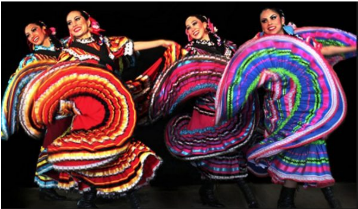
Ballet Folklórico Ollín.

The audience gets a quick tour of Mexico's musical nightlife in México de Noche . Ballet Folklórico Ollín provides a folkloric dance component to three musical groups that offer romantic duets and lively mariachi. The Ford, 2580 Cahuenga Blvd. East, Hollywood; Sat., Oct. 9, 8 p.m., $50-$100. Info, tickets & Covid protocols at The Ford .