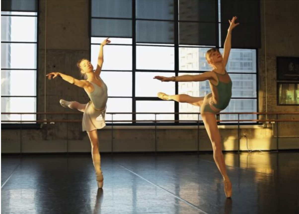
Pointeworks.