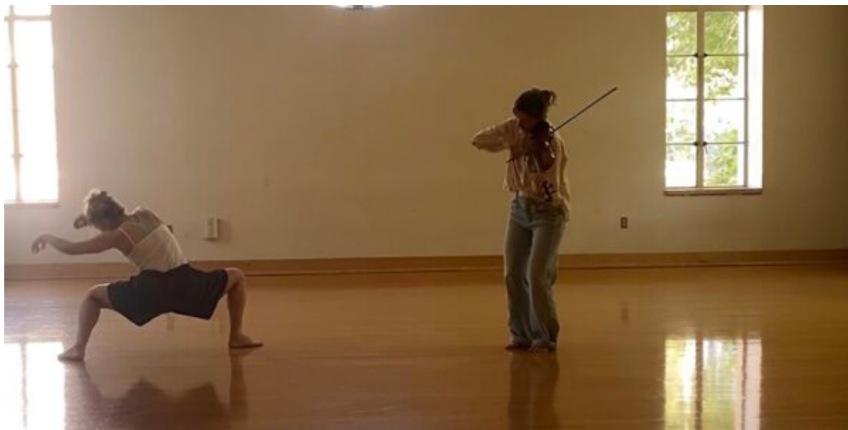
Kairos.