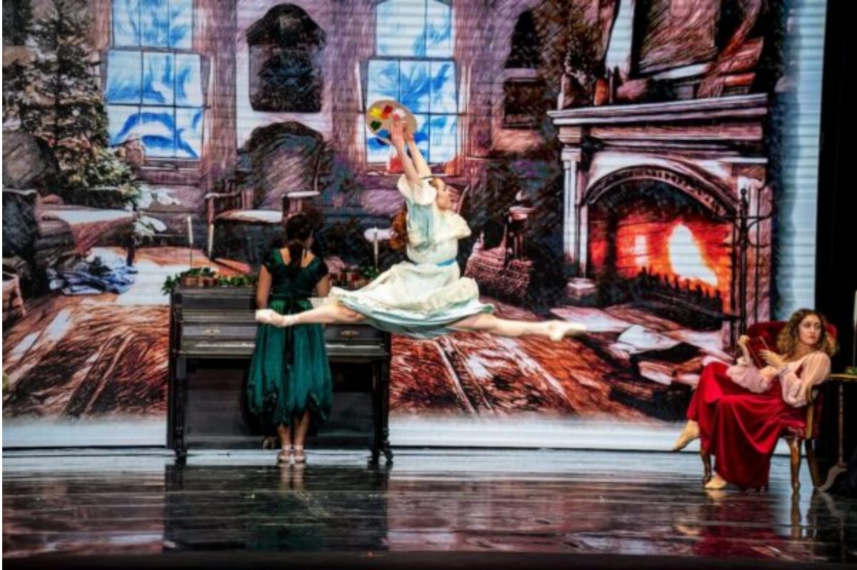
Little Women Ballet.