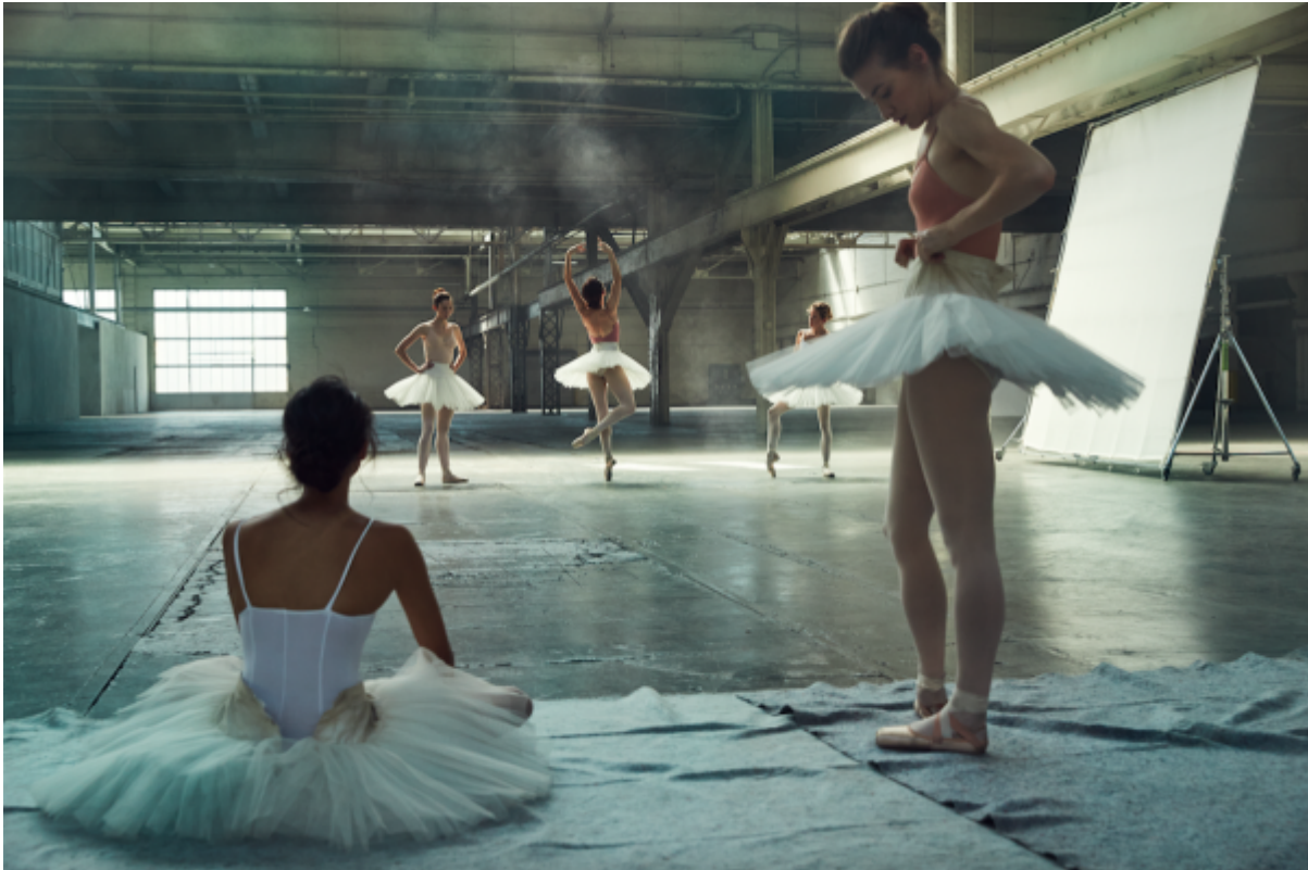
American Contemporary Ballet.