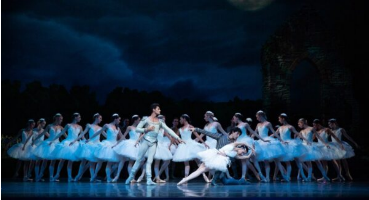
Miami City Ballet "Swan Lake."