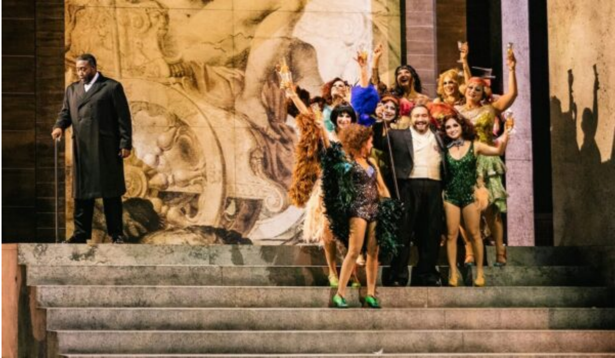
LA Opera's Rigoletto . Photo by Kyle Flubacker