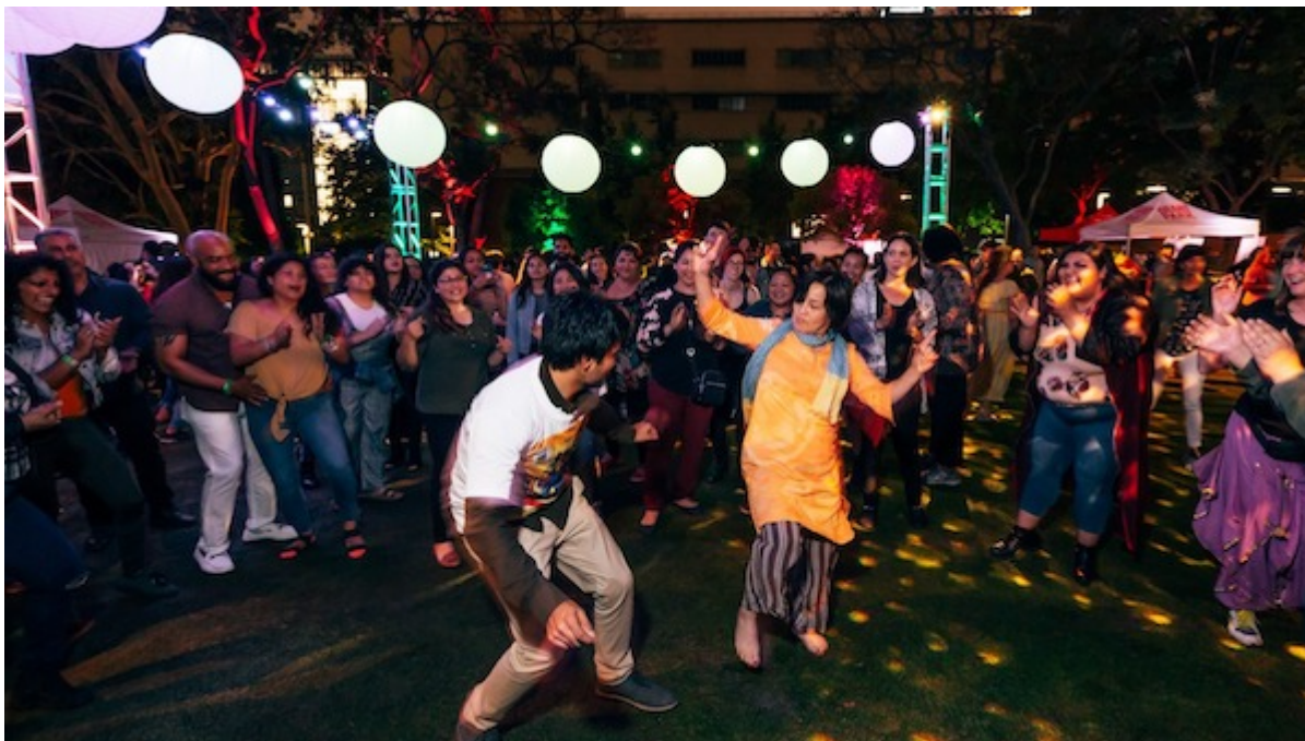
Dance DTLA Bollywood.