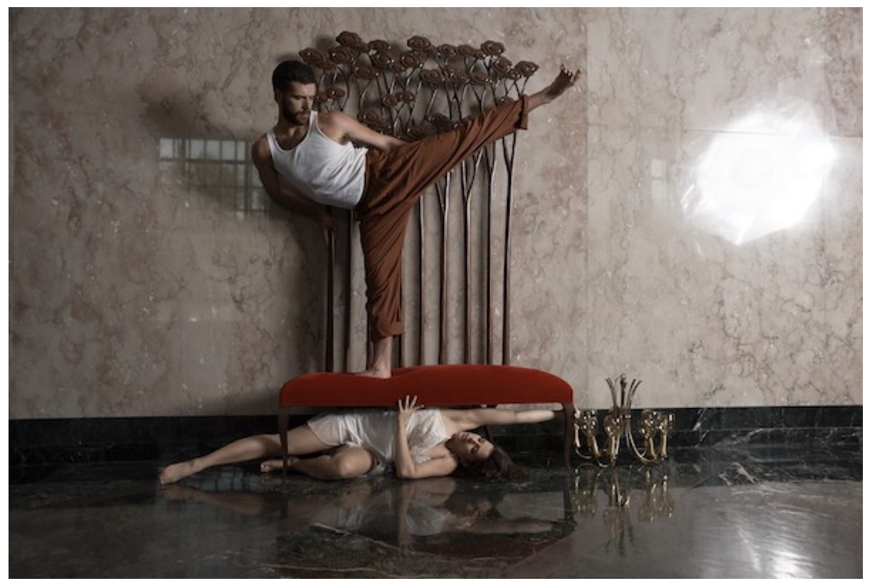
Heidi Duckler Dance, The Chandelier.