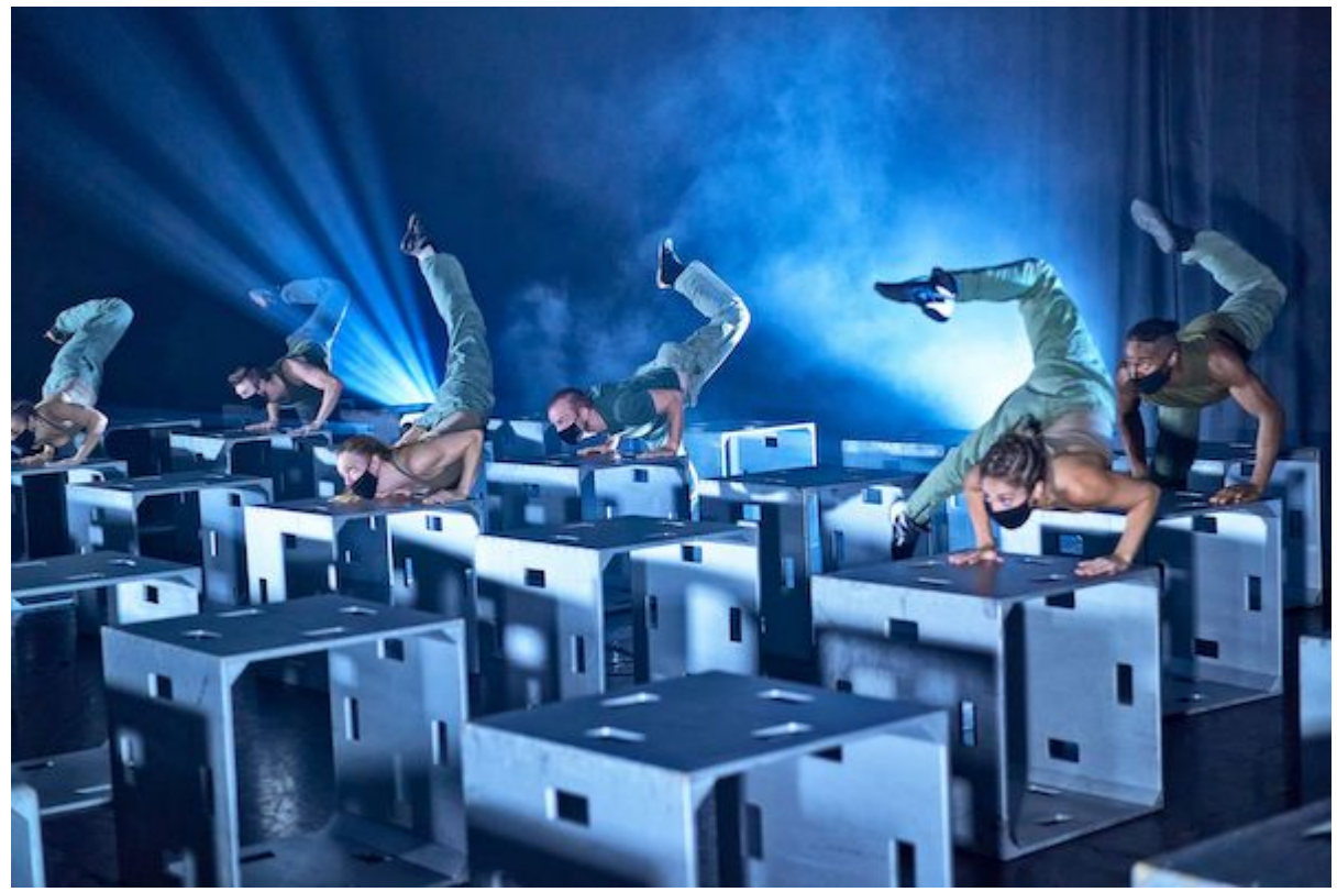
Diavolo Veterans Project.

One of the most powerful dance videos to emerge during the initial months of the pandemic came from Diavolo Architecture in Motion 's Veterans Project with the stories and insights of military veterans who had become front line medical workers during the pandemic. The veterans went toe to toe in bravura movement with some of Diavolo's astonishing athletes and signature structures. The Veterans Project most recent video is an equally mesmerizing endeavor, the product of an eight day workshop with writings by the veterans interpreted by dancers from around the world. The final product of S.O.S. Veterans Project 2021 premiered appropriately on July 4 and streams until August 4 on Diavolo's YouTube page at YouTube.