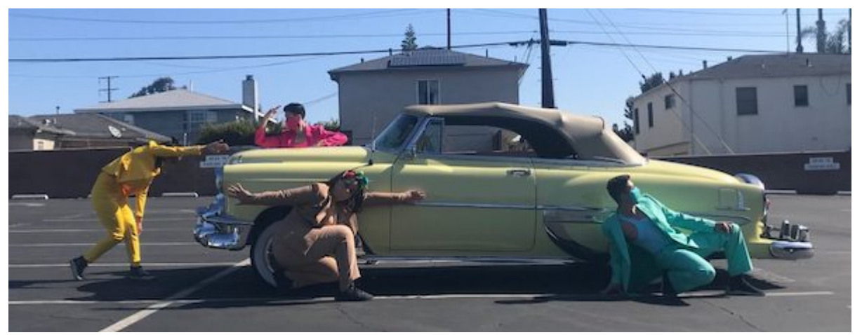
Primera Generación Dance Collective's "low riting."