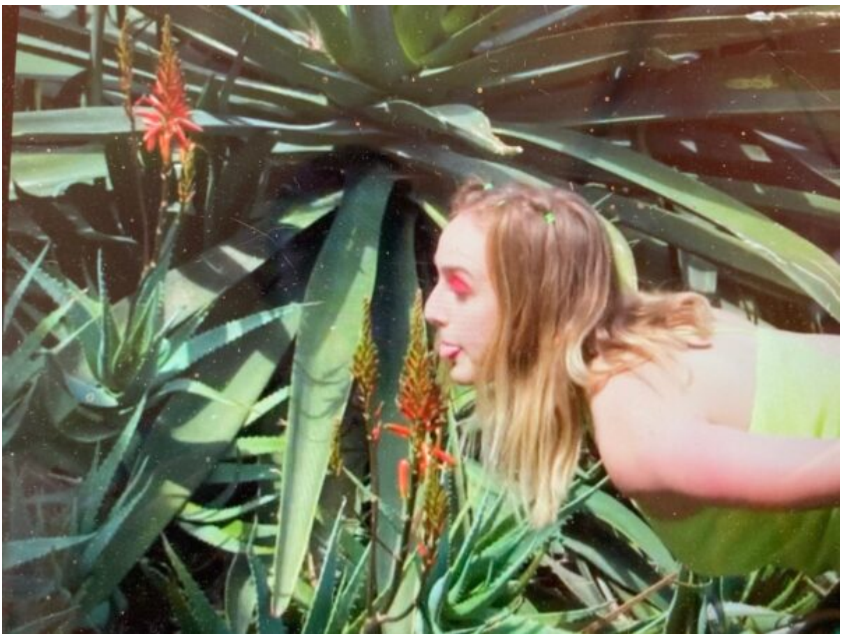
Rosanna Gamson/WorldWide.

the tales of the ten travelers unfold one at a time, Gamson's The Decameron Project rolls out ten films, each made by a different artist. All ten episodes are now live and viewable for free on RGWW and on Instagram.