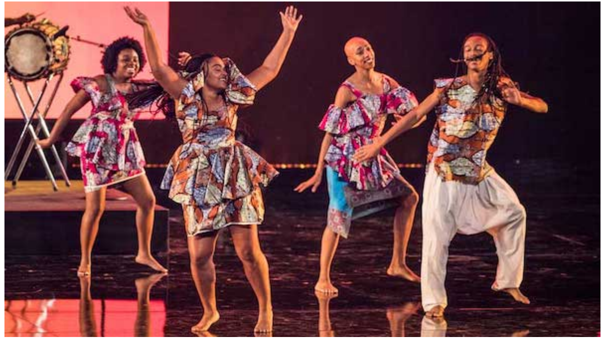
Le Ballet Dembaya.