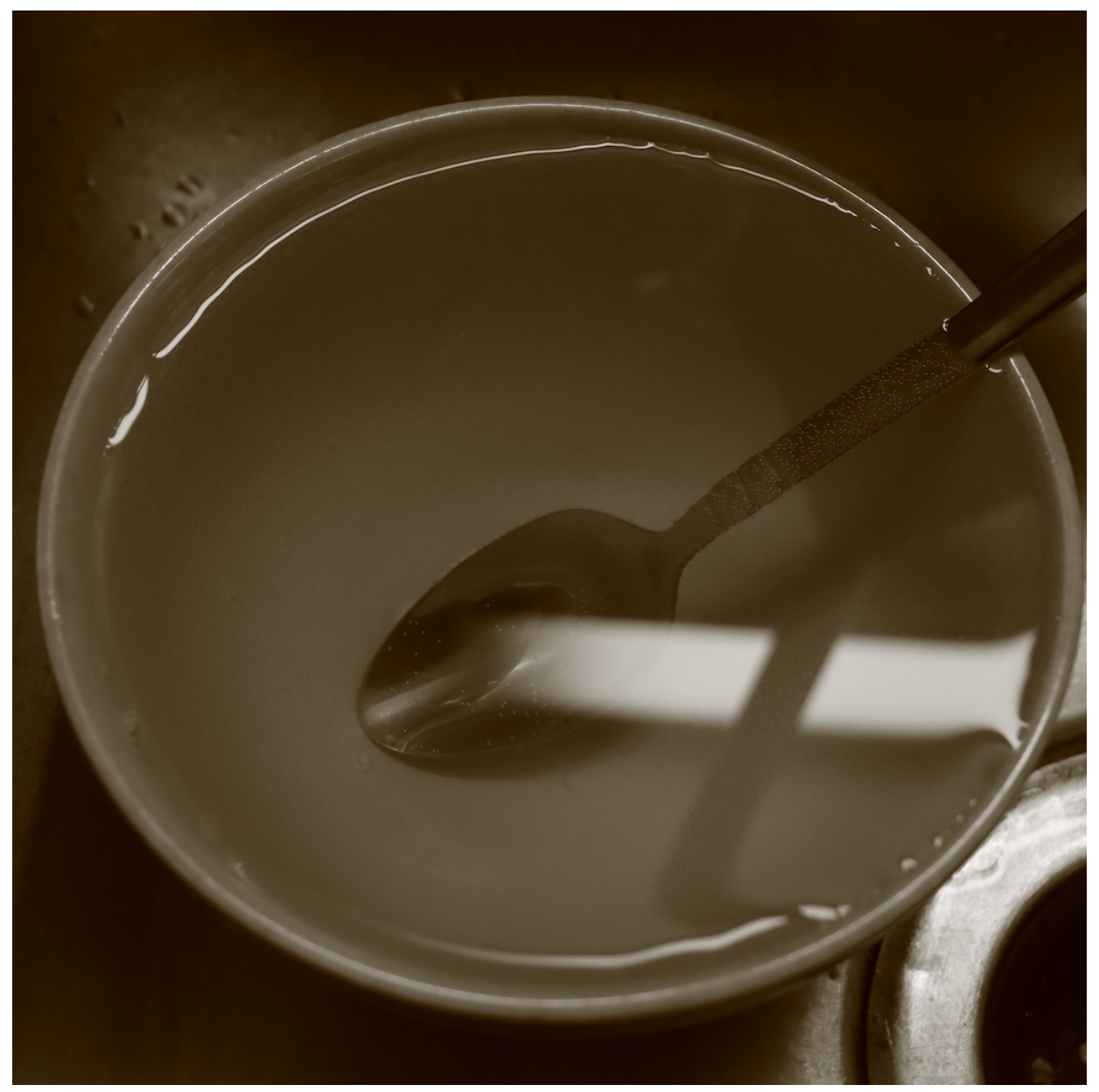
Light catching water in a bowl

Standing water is always horizontal even when its container is sloped as in this case. The shiny circular edge of the standing water, the immersed spoon and its shadow, and the reflection of the wall mounted neon light, all produce an accidentally playful visual ballet of overlapping shapes