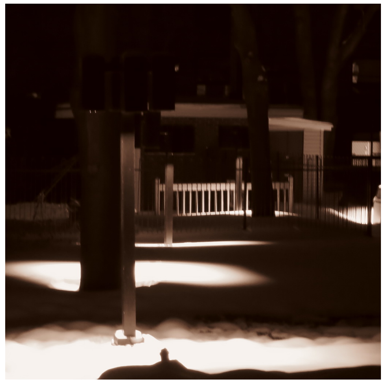
Snow-covered yard under spot lights

The undulating surface of the spot-lit snow cover gives it a cotton like ethereal appearance, out of which trees, fences and building columns seem to sprout.