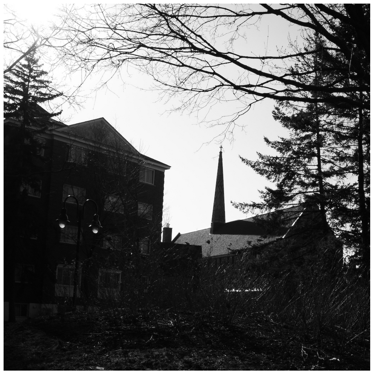
Spring afternoon back lighting

The crispness of the air is reflected in the jagged backlit building roof line against a cool afternoon clear sky, the light of which is brought down so to speak, by reflective roof edges and street lights, to be picked up eventually by the shiny plants.