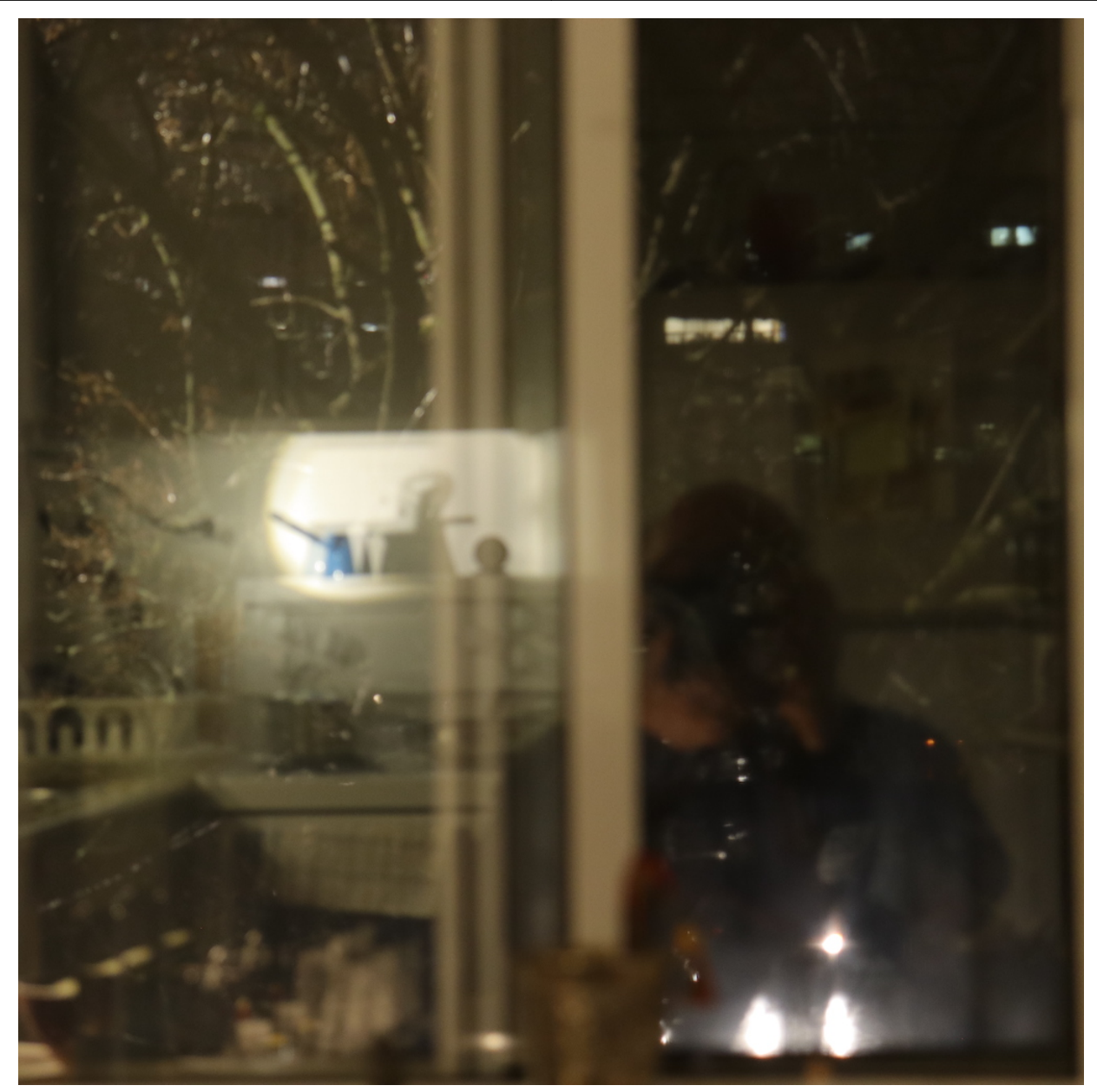
Direct and reflected light on window

When coming through, or being reflected by a pane of glass, light will produce a superposition of images that will include exterior items such as buildings, trees or the headlights of a passing car, and interior items such as kitchen equipment and the photographer ... note the spot-lit touch of blue of the Turkish coffee maker ... all in an artful out of focus.