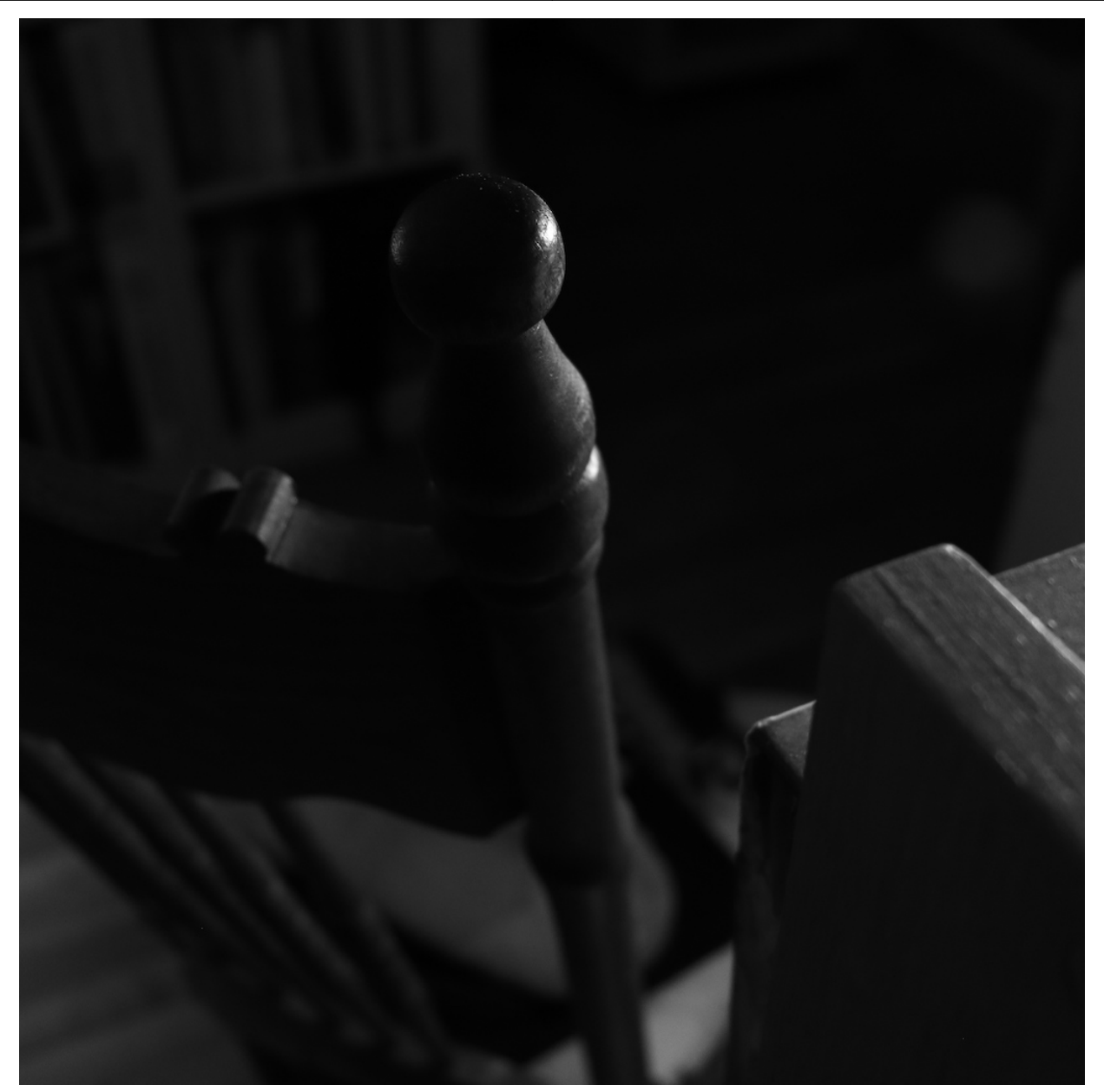
Caress of the night light

In the 5-am darkness of my living room I catch shiny spots on the back support of the rocking chair and the edges of a bookcase, the rest of these appearing to be caressed by the soft night light ... underexposure allows it all to come out of the surrounding darkness.