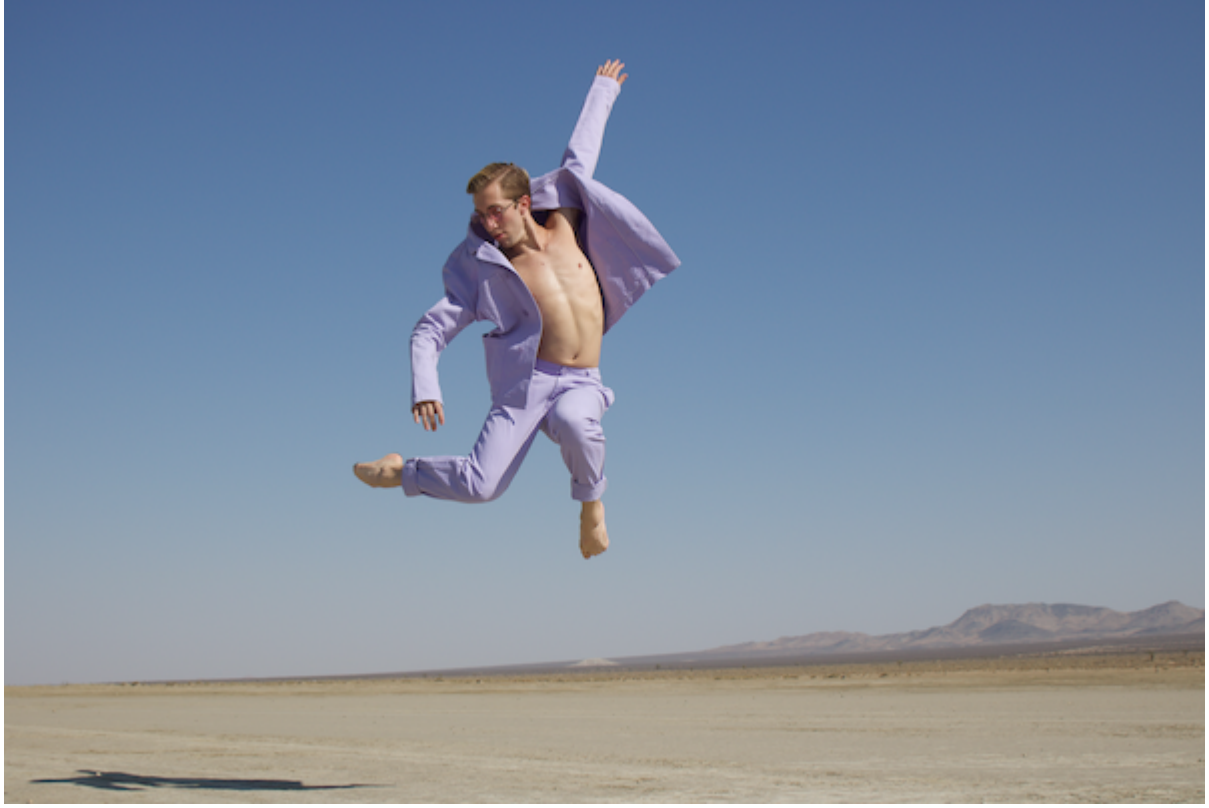
FUSE Dance.

So-Cal Dance Invitational at Martha B. Knoebel Theater, Cal State University Long Beach, 6200 Atherton St., Long Beach; Sat., May 6, 8 pm, $35, $25 students. Brown Paper Tickets.