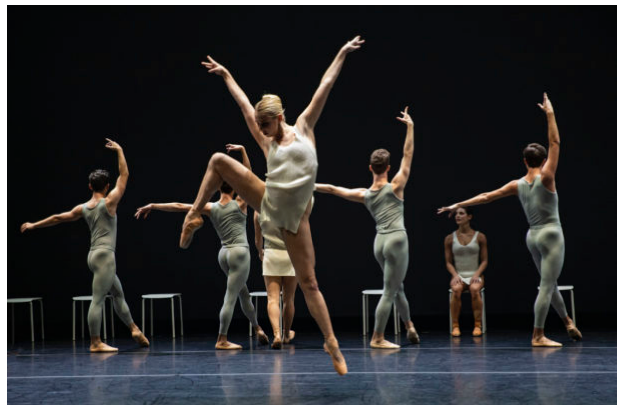
USC Glorya Kaufman School of Dance.