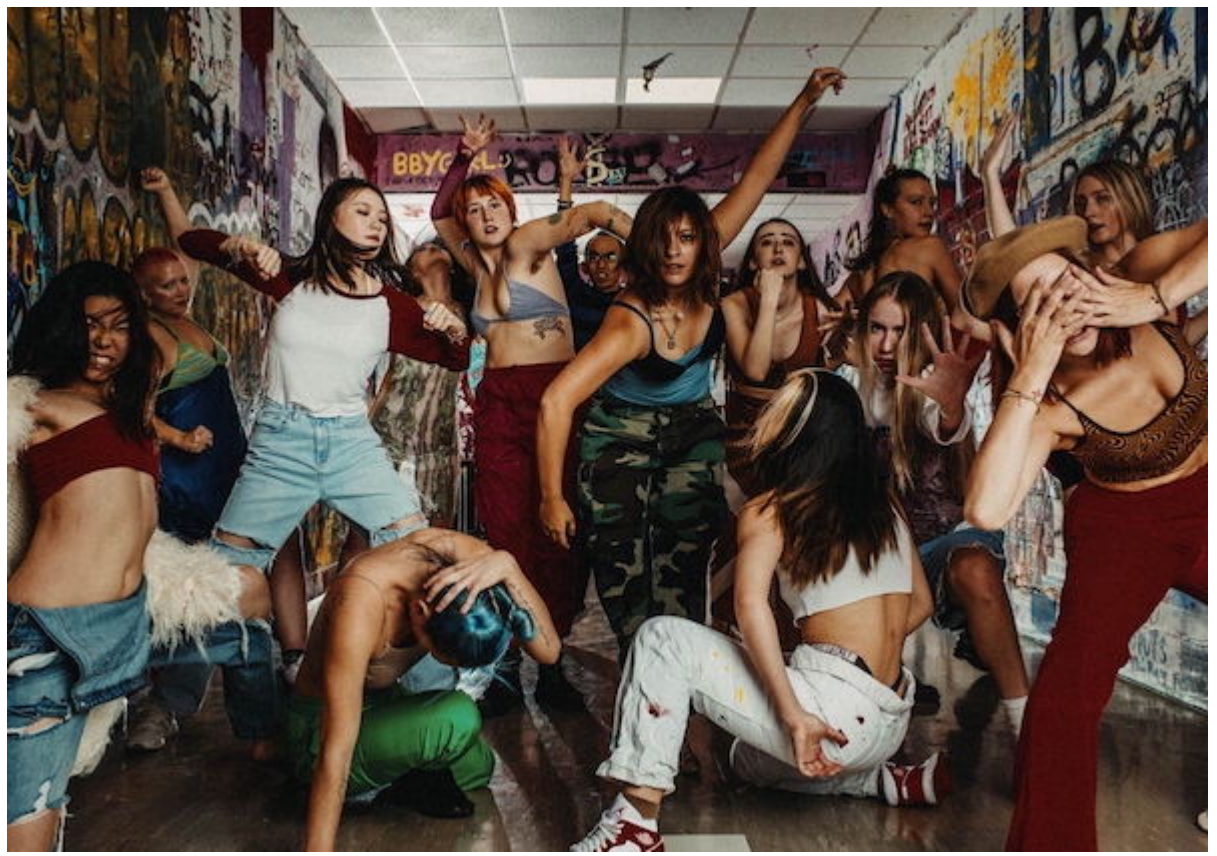
CalArts Dance.

An Evening of Dance featuring performances by the pre-professional students from the American Ballet Theatre Gillespie School is a benefit for the ballet school. Judy Morr Theater, Segerstrom Center for the Arts, 600 Town Center Dr., Costa Mesa; Sat., April 29, 5:30 pm. $150, $125 students. ocpasdedeux@gmail.com.