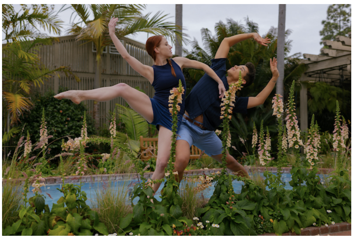
Backhausdance.

Library and Gardens, 2647 East Coast Hwy., Corona Del Mar; Sat.-Sun., April 29-30, 7:30 pm, $60-$1,500. Backhaus.