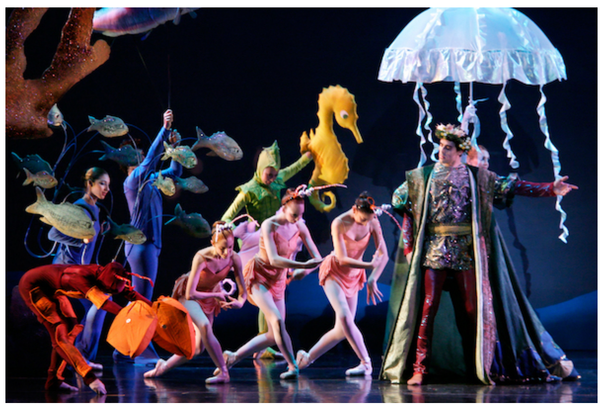
Inland Pacific Ballet.