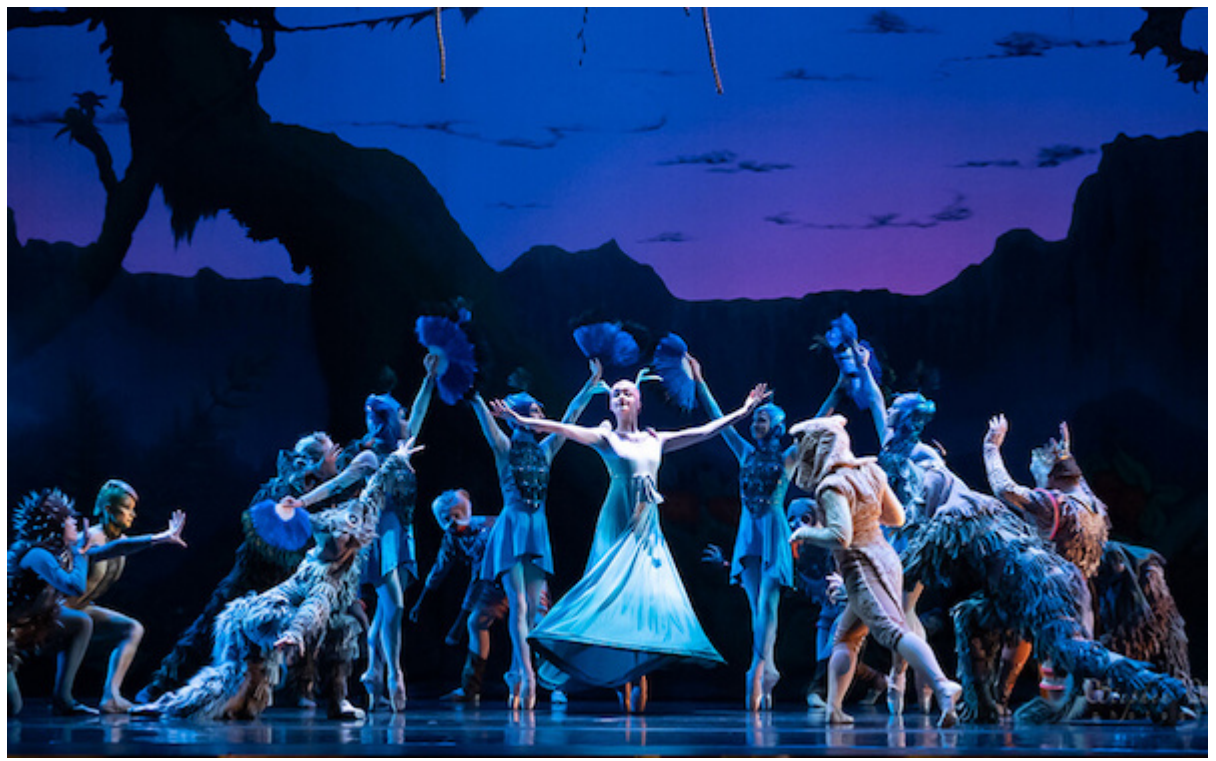
State Street Ballet.

wonder what that clearly vintage structure is doing tucked among the office buildings. Find out at The Ebell of LA, 743 S. Lucerne Blvd., Hancock Park; Mon., May 1, 1 pm, $60, The Ebell of LA.