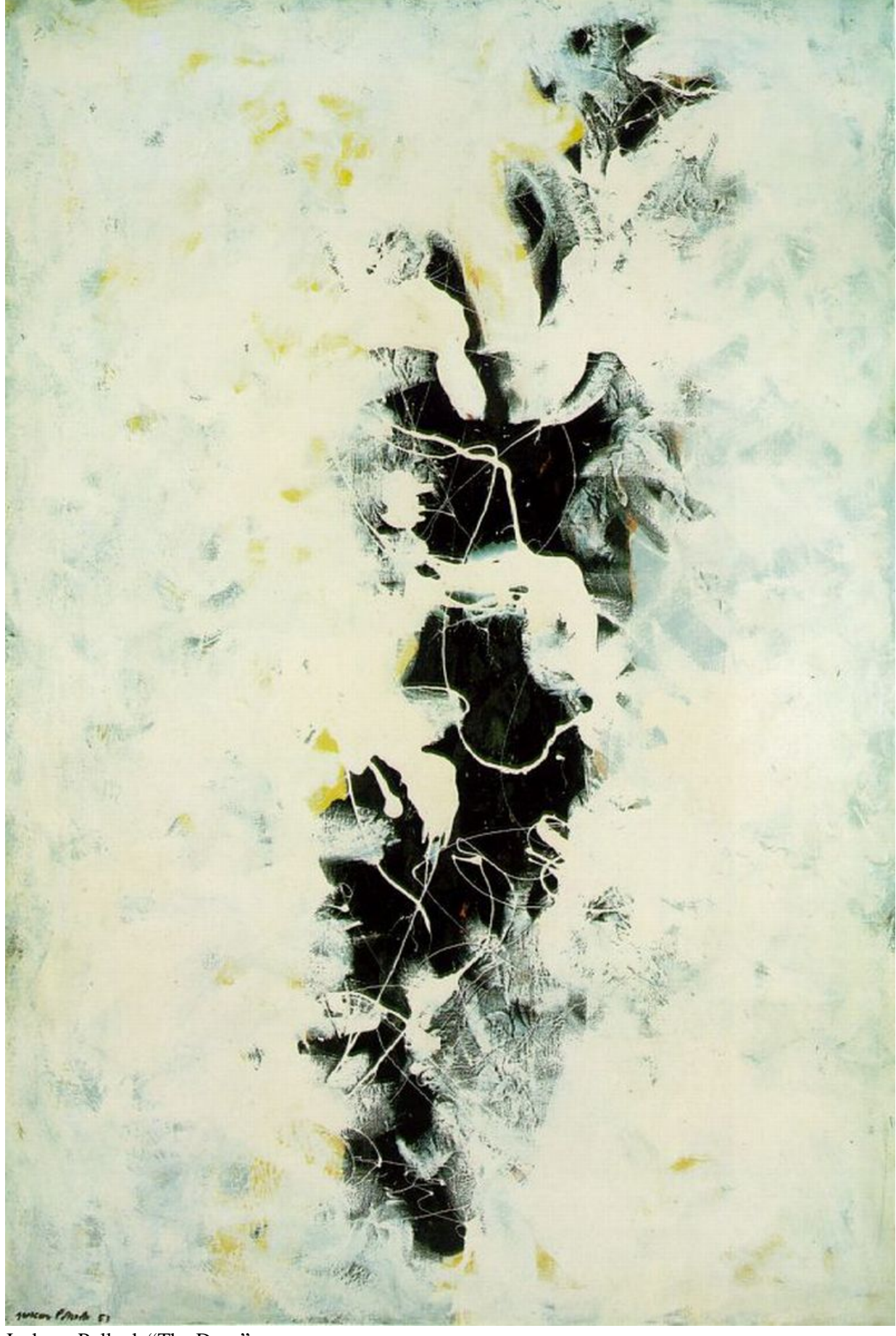
Jackson Pollock "The Deep"