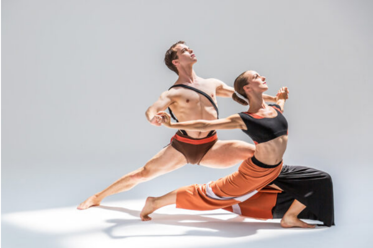
Martha Graham Dance Company.