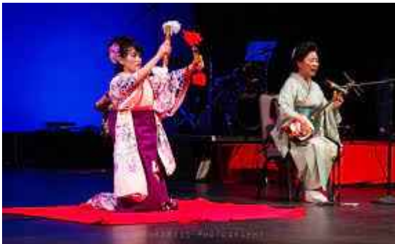
Matsutoyo Kai.

Step into a world of Japanese folk dance and traditional music in this 58 th anniversary celebration of Matsutoyoi Kai . Special guest artists from Japan join talented performers ranging from adorable young ones to elegant elders and accomplished adults who dance, sing and perform on traditional instruments. James R. Armstrong Theatre, 3330 Civic Center Dr., Torrance; Sun., Oct. 1, 1 pm, $23. Matsutoyo Kai .