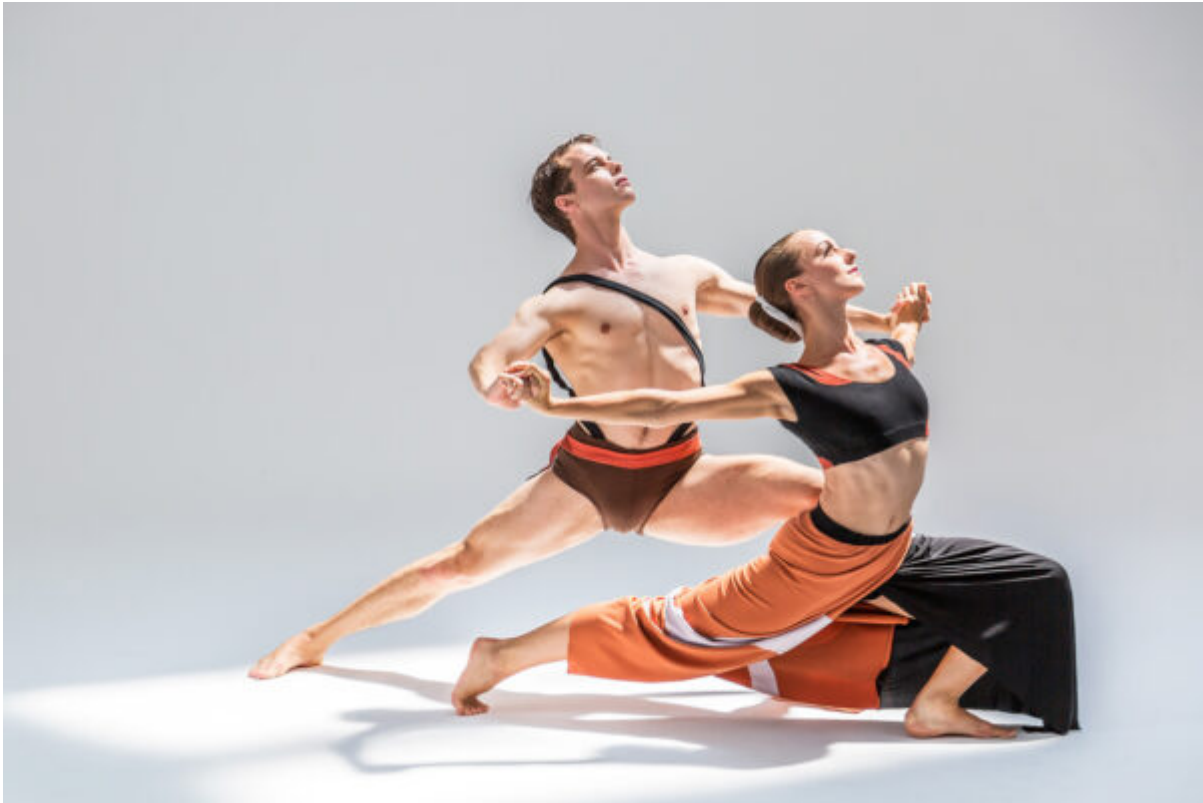
Martha Graham Dance Company.