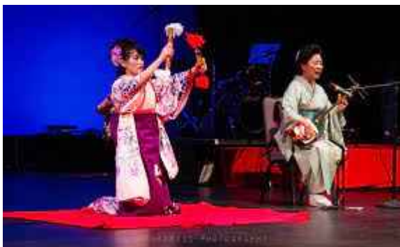
Matsutoyo Kai.

Step into a world of Japanese folk dance and traditional music in this 58 th anniversary celebration of Matsutoyoi Kai . Special guest artists from Japan join talented performers ranging from adorable young ones to elegant elders and accomplished adults who dance, sing and perform on traditional instruments. James R. Armstrong Theatre, 3330 Civic Center Dr., Torrance; Sun., Oct. 1, 1 pm, $23. Matsutoyo Kai .