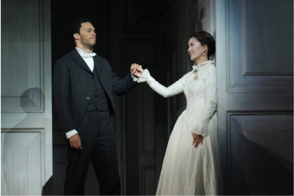
LA Opera's "Don Giovanni."