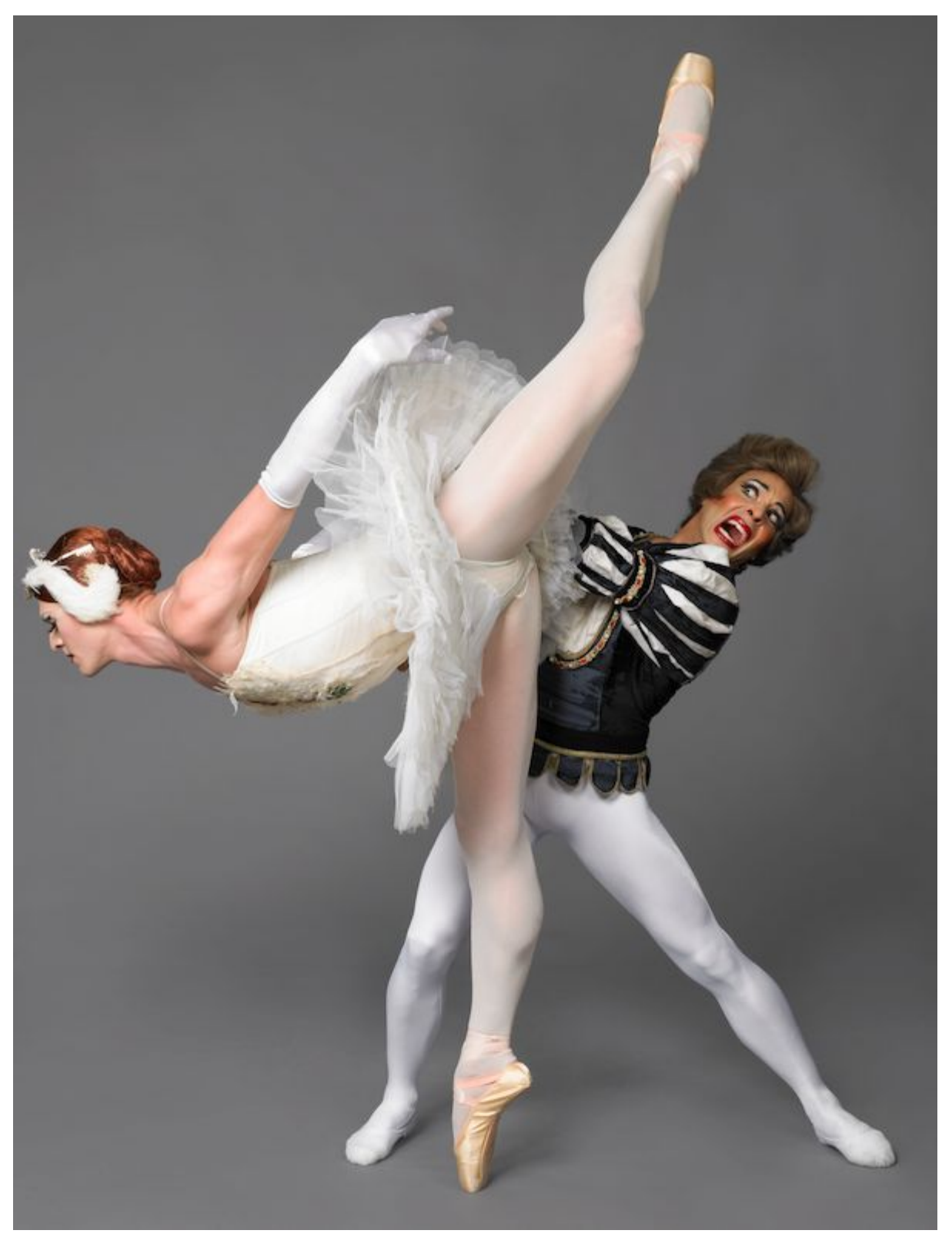
Les Ballets Trockadero de Monte Carlo.