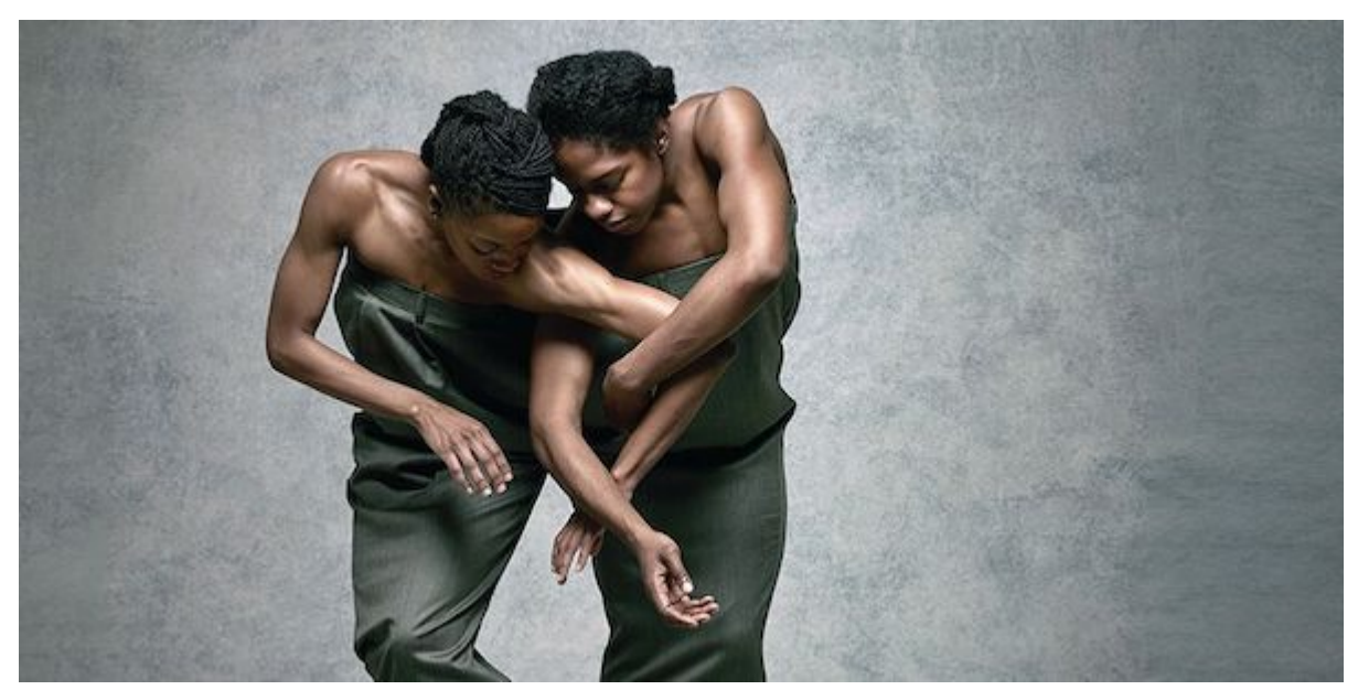
A.I.M. by Kyle Abraham.

• A.I.M. by Kyle Abraham in An Untitled Love at at Carpenter Performing Arts Center, Cal State University 6200 E. Atherton St., Long Beach, Sat., Feb. 5, 8pm, $45. Tix.