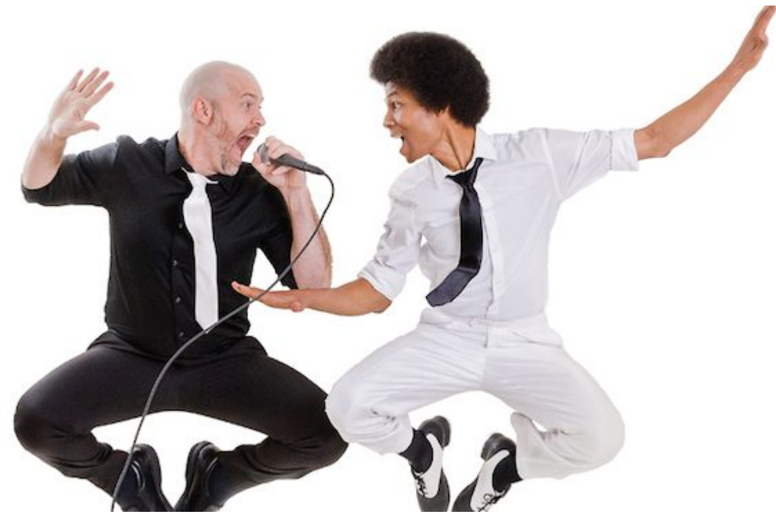
Collision of Rhythm.

join forces in Collision of Rhythm at Pepperdine University, Smothers Theatre, 24255 Pacific Coast Hwy., Malibu; Sun., Jan. 30, 3pm, $20-$40. Info, tickets & Covid protocols at Pepperdine University.