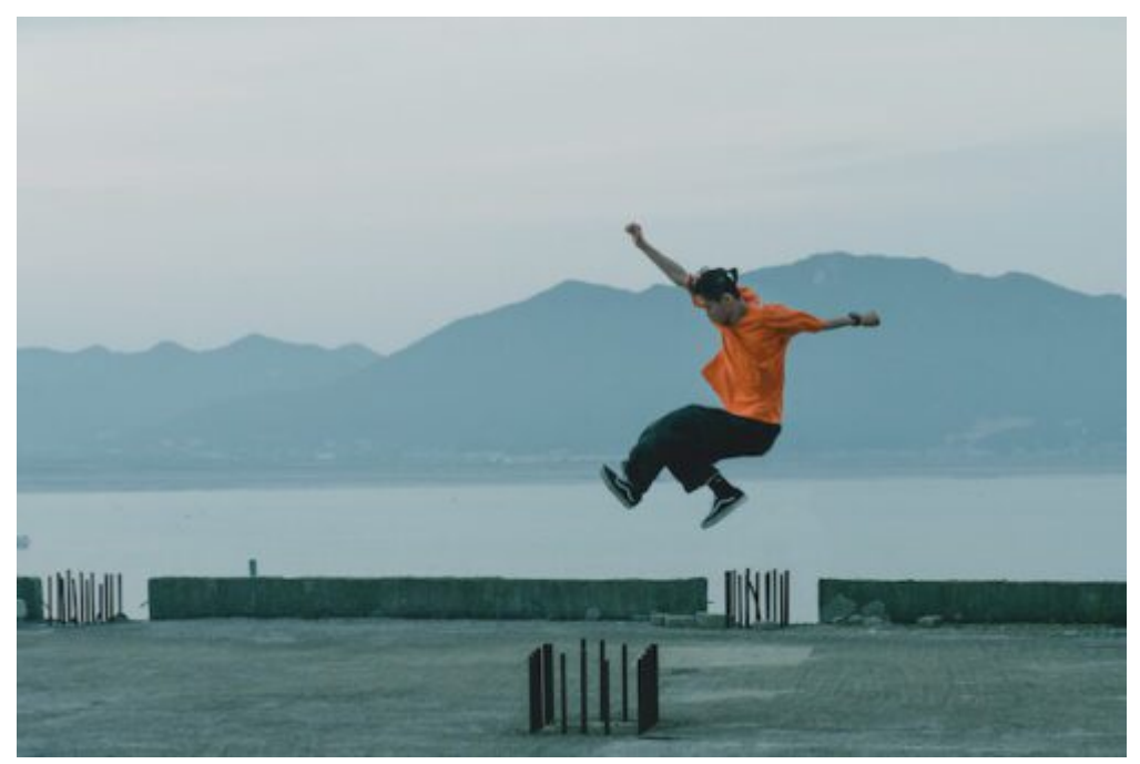
Dance Camera West.