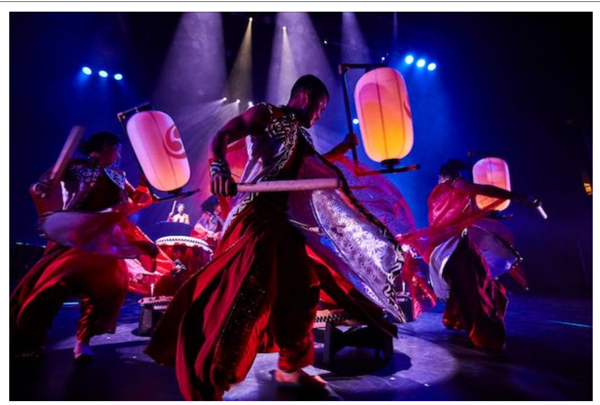
Yamato-the Drummers of Japan.