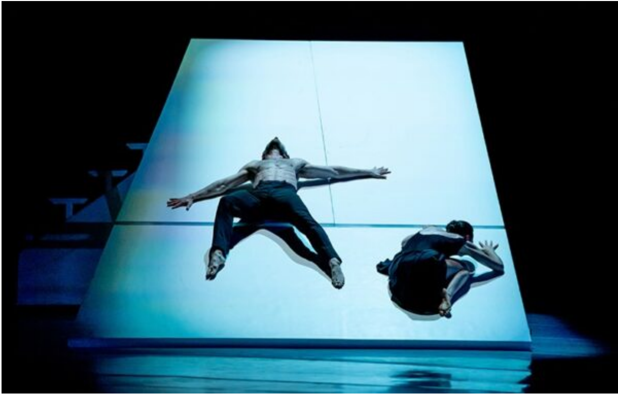
Los Angeles Ballet.