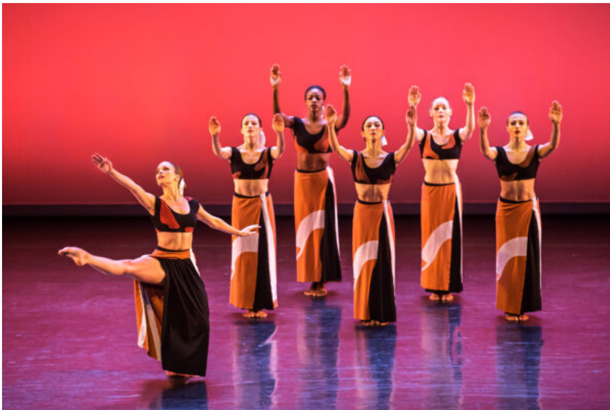
Martha Graham Dance Company.

Marking the centenary of modern dance legend Martha Graham, her eponymous Martha Graham Dance Company stops off at two SoCal venues with performances that include her iconic Appalachian Spring with music by Aaron Copeland. Segerstrom Center for the Arts, 600 Town Center Dr., Costa Mesa; Sat., Jan. 18, 7:30 pm, $44.07-$134.47. SCFTA . Also at San Diego Civic Theatre, 1100 Third Ave., San Diego; Sat., Jan. 25, 7:30 pm, $70.50-$115.50. La Jolla Music Society .