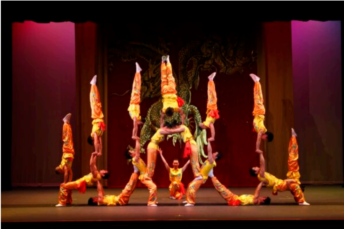
The Peking Acrobats.